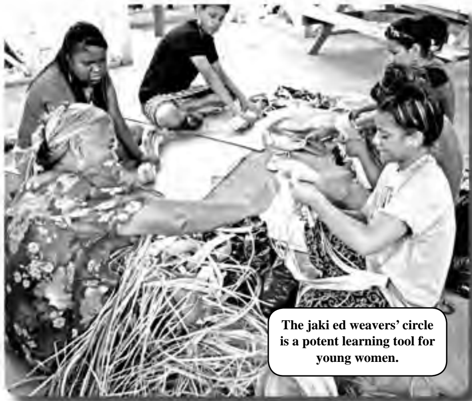
The jaki ed weavers' circle is a potent learning tool for young women.